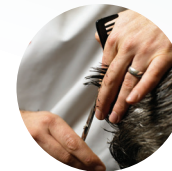
Working as a barber/hair dresser