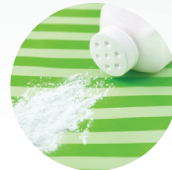
Talc-based body powder