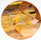
Insulation glass wool