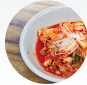
Pickled vegetables (traditional in Asia)