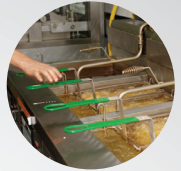
High temperature frying