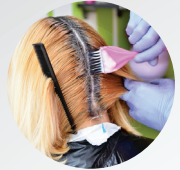
Hair coloring products